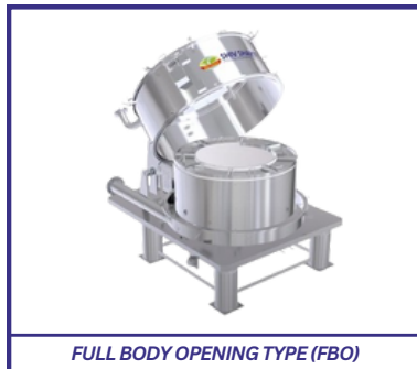
FULL BODY OPENING TYPE (FBO)