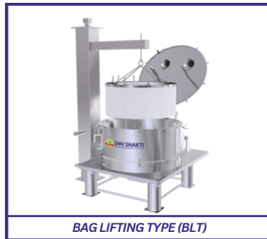
BAG LIFTING TYPE (BLT)