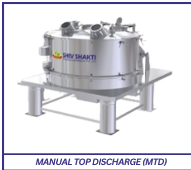
MANUAL TOP DISCHARGE (MTD)